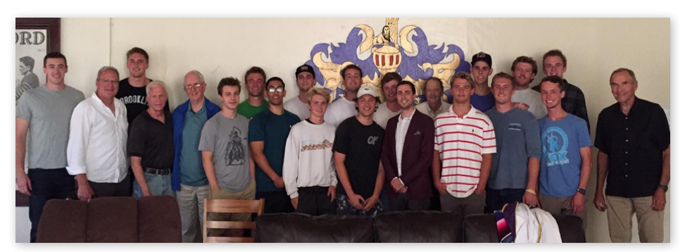
House Corp and Cal Beta Members