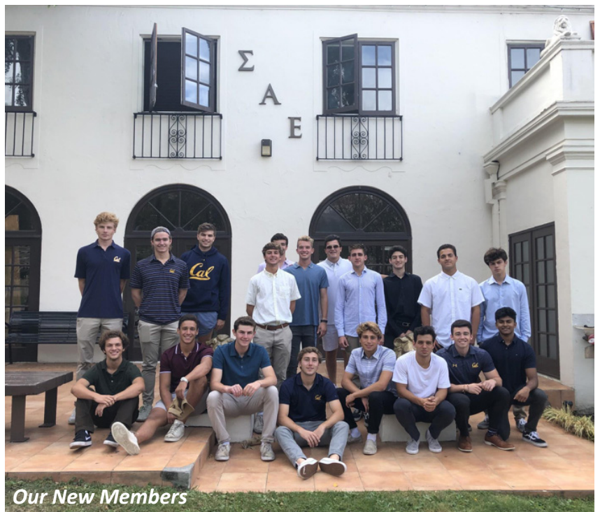
Our New Members