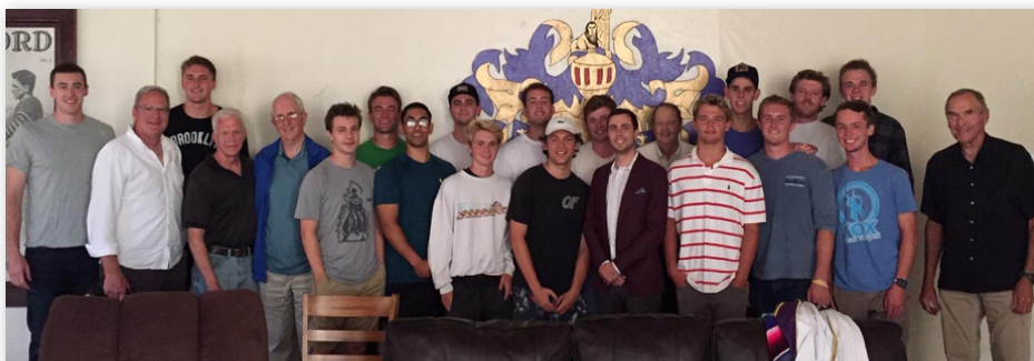
House Corp and Cal Beta Members