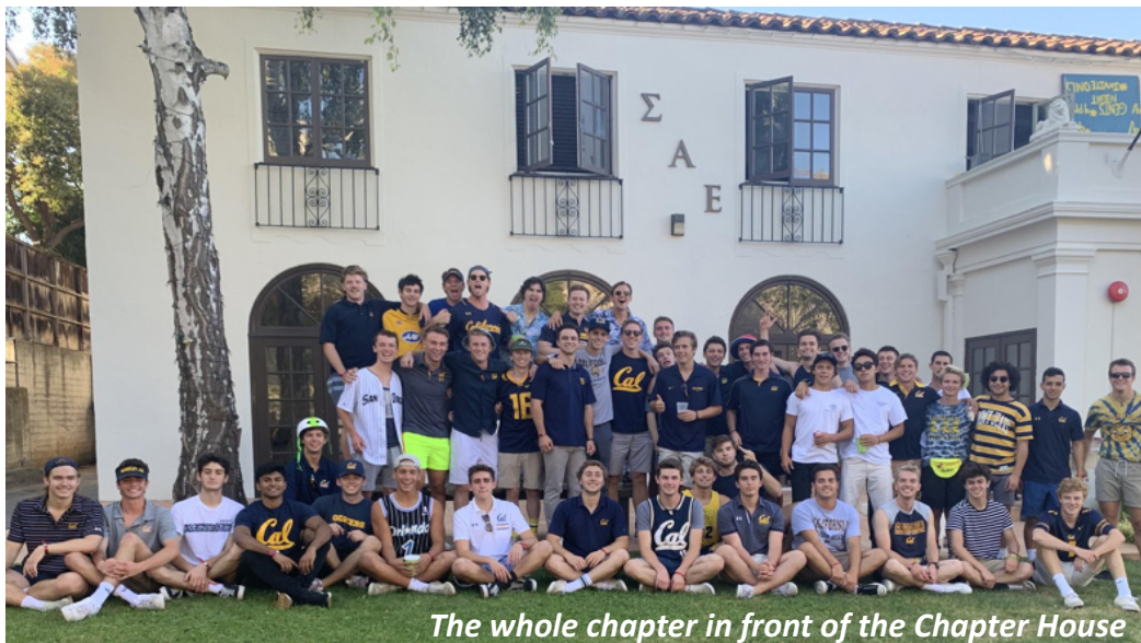
The whole chapter in front of the Chapter House